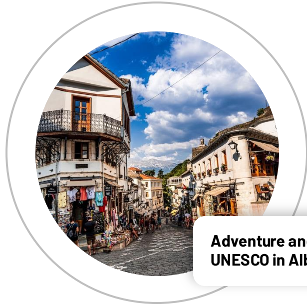
Adventure and UNESCO in Albania