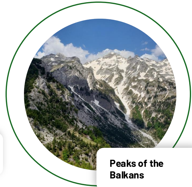
Peaks of the Balkans