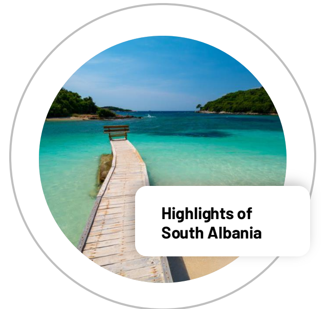
Highlights of South Albania